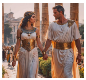
Greek Goddess & Toga Party!

SAME PRICE AS LAST YEAR NO INCREASE! THANK YOU SPONSORS!